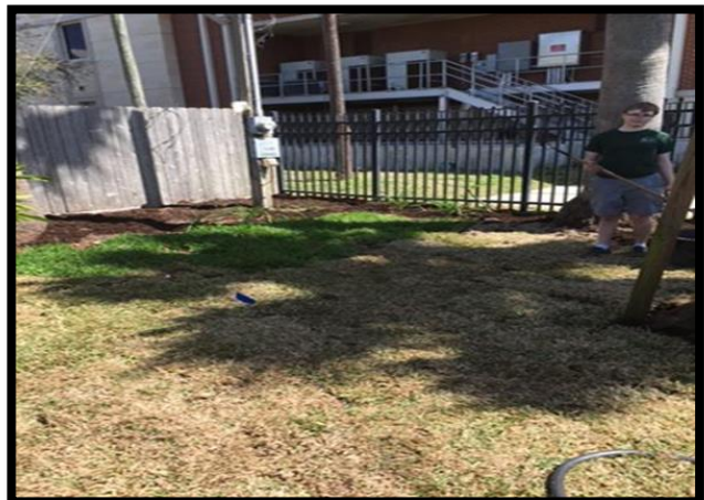
This corner is named Pat's Corner because she pulled out the ginger in the Park – a nightmare!