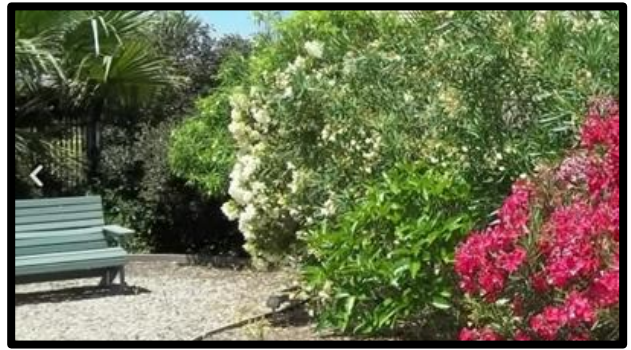
Contact us to Buy a Named Brick! - $50

Thanks to the Aggies! Six participated in their annual "Big Event" Service Day on March 26, 2022 by helping us spread sod in one section of the garden. We are finding it is just too much ($ and time) to maintain the garden and remove the weeds on our own, even with mulch. We believe it will be easier to mow the sod than pull all the weeds. We will be leaving space around the oleanders to allow them the freedom to grow. We will know this summer if this has been a successful strategy. In order to spend less on sod, we laid the pads in a diagonal formation to let the grass grow in between.